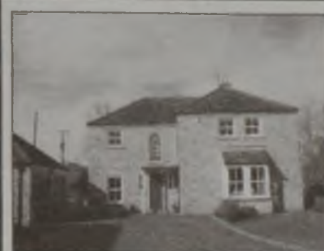
Rivendell, Folly View, Romaldkirk

Exceptional Modern Detached House on the edge of one of the areas most sought after villages. Cloakroom/WC, Living Room, Dining Room, Family Room/Study, Breakfast Kitchen, Utility Room, 4 Bedrooms (all En-Suite), Oil Central Heating, Double Glazing, Detached Double Garage, Security System, Views to rear over open countryside, Established Gardens.