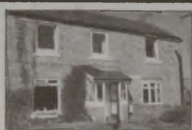
The Old Post Office, 6 Stainton Village, Barnard Castle

Double-fronted Period House providing generous and versatile accommodation with sylvan setting to the rear. Sitting Room, Living Room (or Bedroom 4), Shower Room/WC, Dining Room and Kitchen, Conservatory, 3 Bedrooms, Bathroom/WC, Gas Central Heating, Double Glazing, Gardens Front and Rear with adjoining woodland.