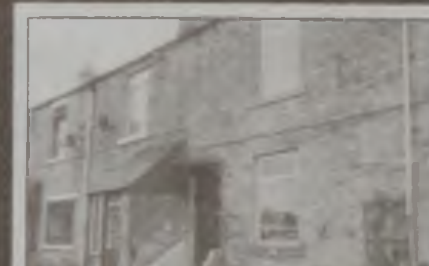
4 Alpine Terrace, Cockfield

Stone built Terraced House requiring some updating in quiet backwater with far-reaching views. Living Room, Dining Kitchen, Rear Hallway, Bathroom/WC, 2 Double Bedrooms, Double Glazing, Front Garden, Rear Yard with Store.