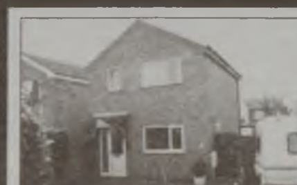
64 Bartlemere, Barnard Castle

Modern Detached Family House occupying good sized corner plot. Entrance Hallway/Dining Area, Living Room, Kitchen, 3 Bedrooms, Bathroom/WC, Part Gas Fired Central Heating, Double Glazing, Garage plus additional Hardstanding, Gardens to three sides.