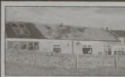
West Farm Cottage, Eggleston

Individual Detached Dormer Bungalow occupying a stunning position and providing immensely versatile accommodation. Cloakroom/WC, Inner Hall, Living Room, Dining Room, Kitchen, Utility Room, Rear Porch, Master Bedroom, Bathroom/WC with Shower Cubicle, Study, Sun Lounge, 3 First Floor Bedrooms (with 2 staircases), Further Study Area, Oil Central Heating, Double Glazing, Single Garage with Workshop and Greenhouse, Low Maintenance Gardens adjoining open countryside.