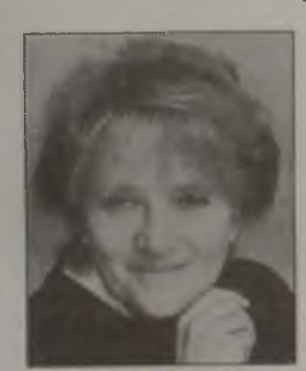
Tel. Teesdale 4