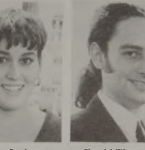
Acting store supervisor