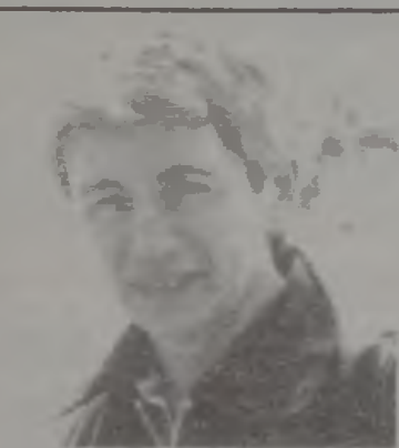
ESSEX WOMAN IS HERE IN BARNEY