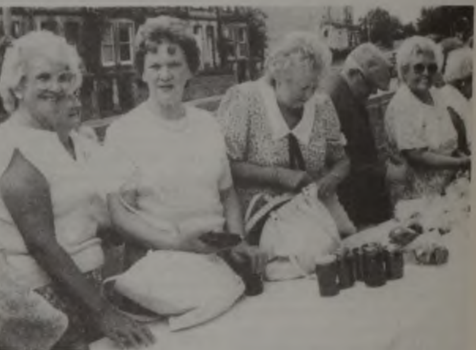
Customers eager to be served on the busy cake stall