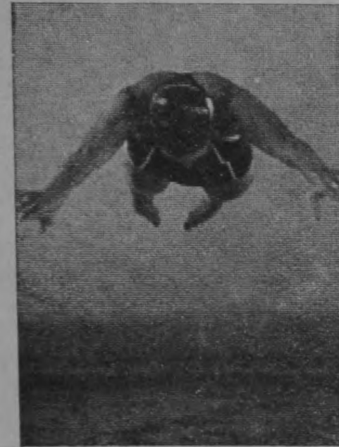
. . . and flat out a split second later, with a side view of the same position shown on the right, a fraction before Catherine hits the water.