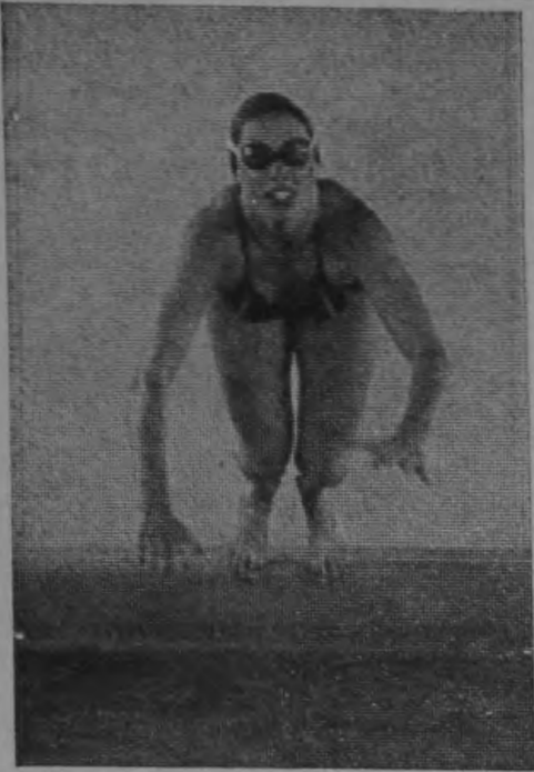
Moment of take off . . .